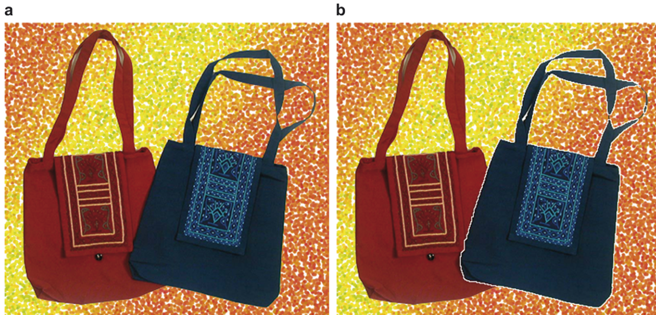
Fig. 1. Result for the detection of the blue bag. \tau = 5 , \sigma = 0.6 , \mu = 1 , \lambda^+ = (0.5, 0.5, 0.5) , \lambda^- = (1, 1, 1) .

In this paper, we have presented a new variational formulation for active contours. This method is a generalization of